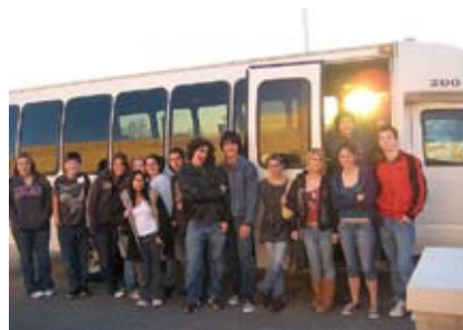
Jewish Teen Convention attendees